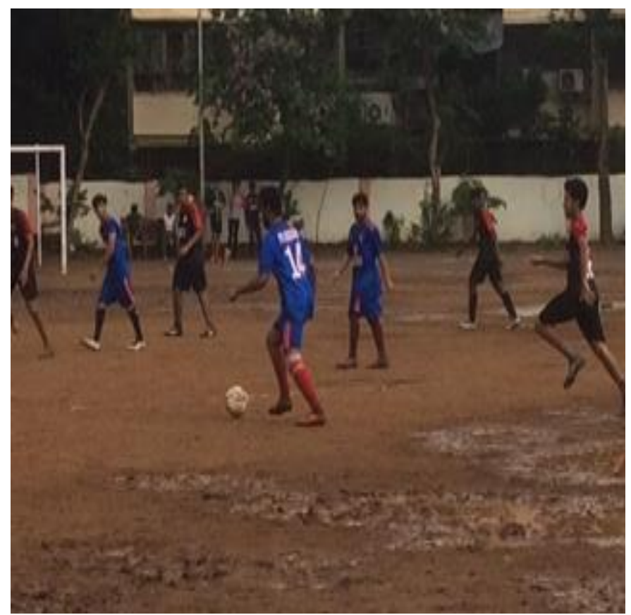
Intra-college football tournament