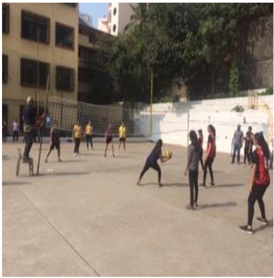
Intra-college throw ball tournament