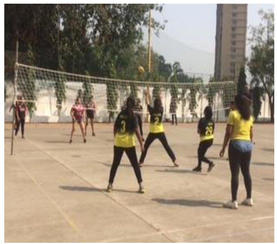
Intra-college Volley ball tournament