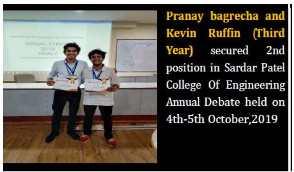
SPCE Annual Debate