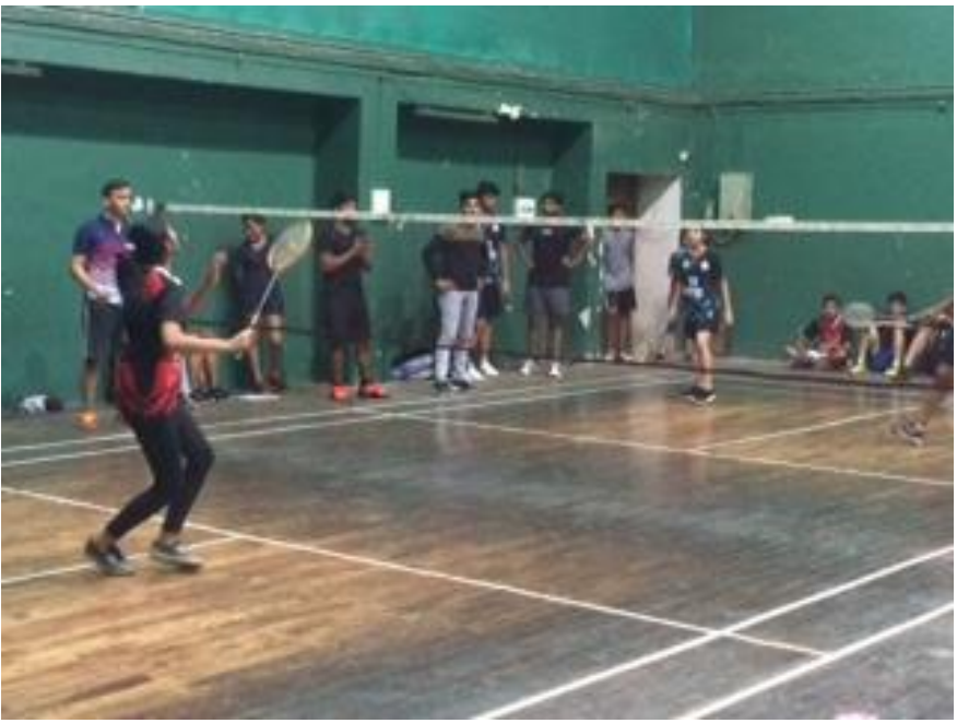
Intra-college badminton tournament