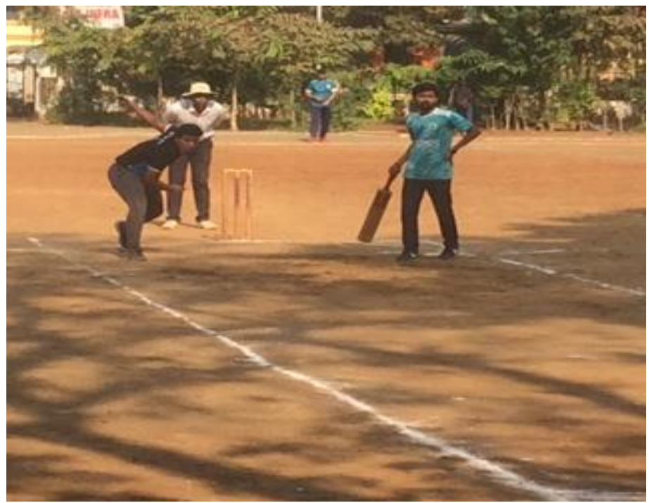
Intra-college Cricket tournament