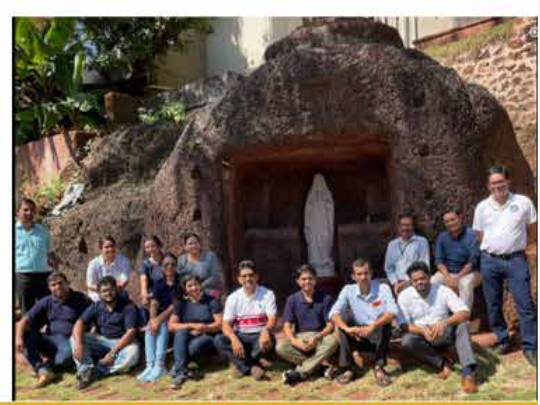
P.C.C.E. Faculty's Heritage Trip to Fr. Agnel Pilar Seminary and Museum