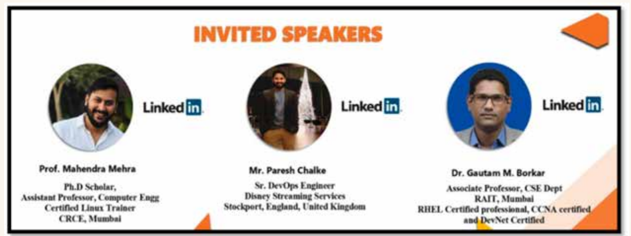
Invited Speakers for Two day FDP on "Essentials of Linux System Administration"